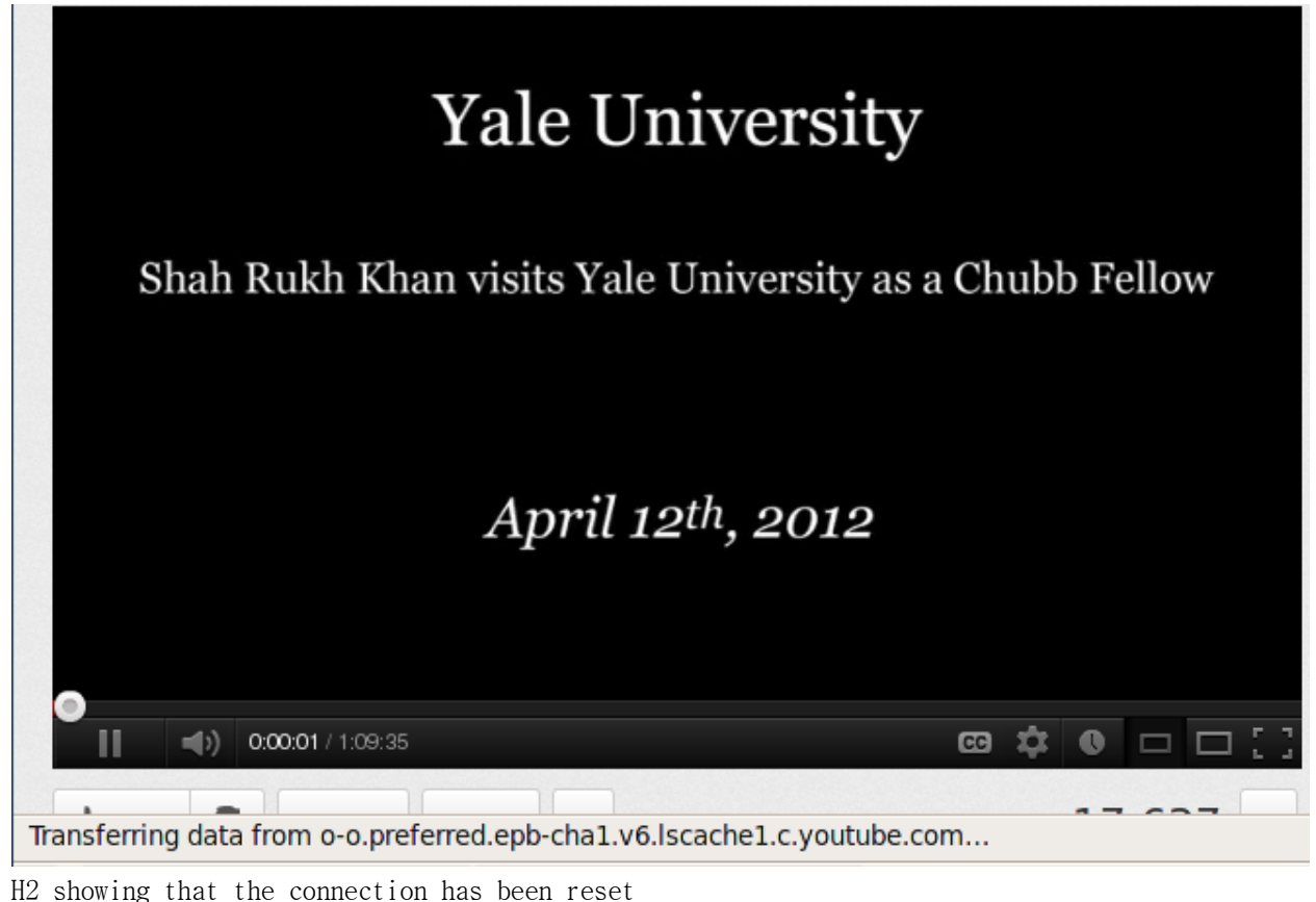
H2 showing a video playing