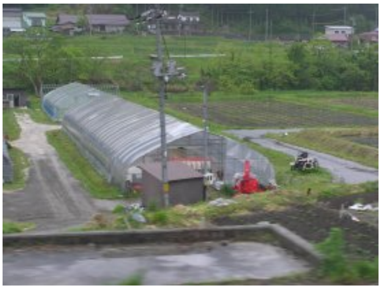
Figure 2-20: Greenhouses in Chugoku Mountains (Okayama Prefecture) A close-up view of several greenhouses in this rural mountainous region.