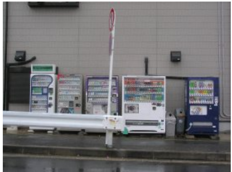
Figure 2-12: Vending machines, Toyota City (Aichi Prefecture) A row of vending machines along a sidewalk in Toyota City. Can you tell what they are selling?