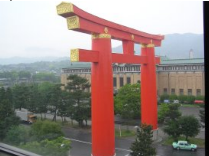
Figure 2-23: Torii gate at Heian Jingu Shrine, Kyoto (Kyoto Prefecture) Torii gates are found at the entrance to all Shinto shrines. Specifically, they mark the entrance to the sacred "inside" space of the shrine. More information about this shrine can be found at this Web site: http://www.heianjingu.or.jp/index e.html

Religious structures are an important part of the Japanese landscape. In the late 1980s, there were over 81,000 Shinto shrines and 77,000 Buddhist temples in Japan (Karan, 2005). A few of the more common landscape features of these sites are discussed below.