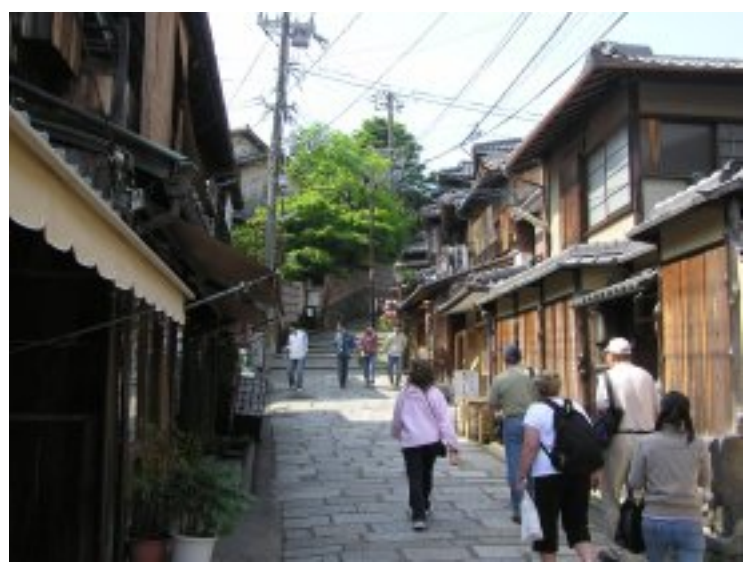
Figure 2-16: Older neighborhood, Kyoto (Kyoto Prefecture)

Even in the older sections of Kyoto, power lines are visible. In the United States, in areas such as this there is often an attempt to preserve the "authenticity" of this landscape, which might include burying power lines to hide the intrusion of modern developments.