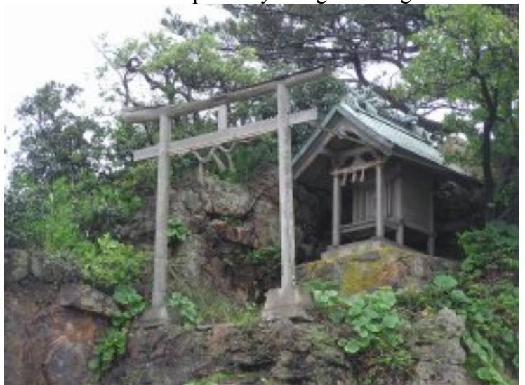
Figure 2-25: Shinto shrine, Benten Island, Inasanahoma Beach, Taisha (Shimane Prefecture) This miniature shrine is on a small island built for the god of fishing, Benten.