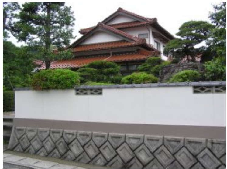
Figure 2-22: House with wall, Hirose (Shimane Prefecture) This scene includes many traditional Japanese landscape characteristics: wall around house, Japanese architecture, and a garden with meticulously-pruned shrubs.