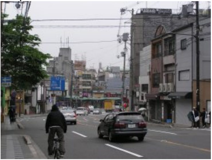
Figure 2-32: Modern architecture, Kyoto (Kyoto Prefecture)

significant ones have been lost. What is also interesting is that new structures incorporate elements of traditional Japanese architecture.