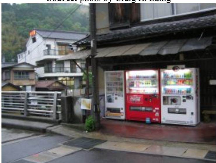
Figure 2-11: Vending machines, Asuke (Aichi Prefecture)

This is a good example of how the Japanese maximize space by cramming vending machines in very restricted spaces.