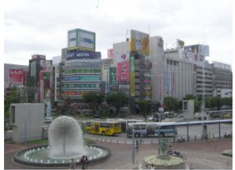
Figure 2-33: Modern architecture, Okayama (Okayama Prefecture) This scene is a good example of urban architectural styles in Japanese cities during the second half of the 20th century.