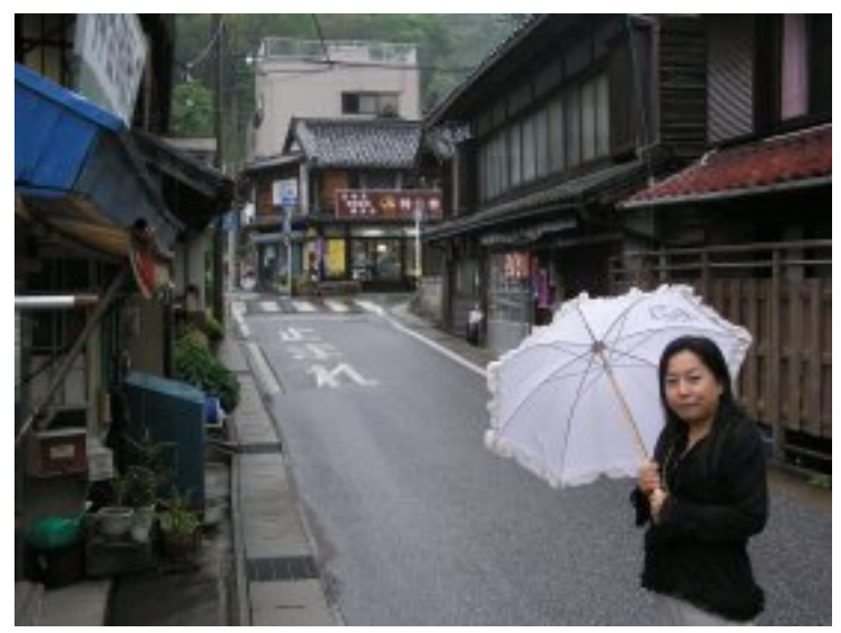
Figure 2-34: Traditional architecture, Asuke (Aichi Prefecture) Notice the difference in the architecture of this small town compared to Figure's 2-32 and 2-33.