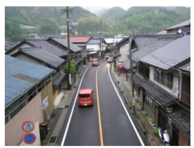
Figure 2-4: Highway, Asuke (Aichi Prefecture)

Flowers play an important role in Japanese culture and the art of flower arranging is held in highesteem.