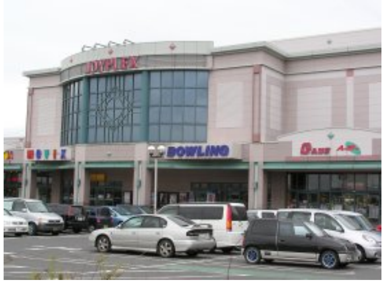
Figure 2-42: Joyplex, Yonago (Tottori Prefecture) What three entertainment venues are combined into this one location?

explanation of Japanese food theme parks can be found at <a href="http://www.japan-guide.com/e/e3035.html">http://www.japan-guide.com/e/e3035.html</a>.