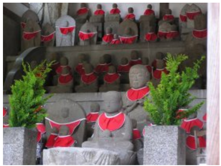
Figure 2-30: Mizuko jizo statues, Kiyomizudera, Kyoto (Kyoto Prefecture) Mizuko jizo statues represent the guardians of young babies who have died from a variety of causes including abortions and stillbirths. It is common to dress them up in bibs and warm clothing.