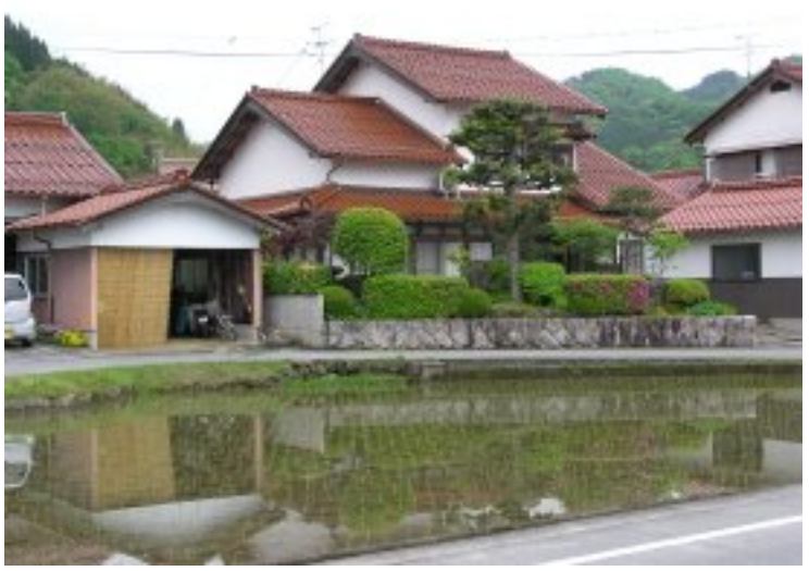
Figure 2-5: House, Hirose (Shimane Prefecture)

One of the first things that an American notices about residential landscapes in Japan is the lack of lawns. Due to space limitations and the preference for gardens, lawns are a rarity, even in suburban or rural areas where one might expect more room for lawns.