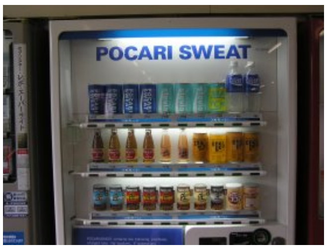
Figure 2-14: Vending machines, Kyoto (Kyoto Prefecture)

This popular sports drink, like Gatorade, has an unusual name in English. A good explanation of this drink's name can be found at: <a href="http://en.wikipedia.org/wiki/Pocari_Sweat">http://en.wikipedia.org/wiki/Pocari_Sweat</a>