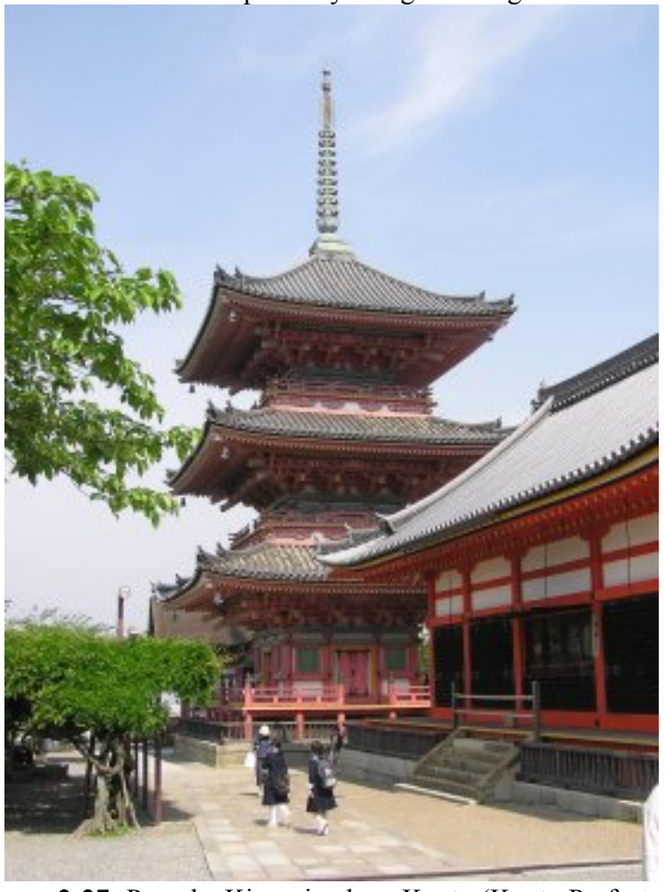
Figure 2-27: Pagoda, Kiyomizudera, Kyoto (Kyoto Prefecture)