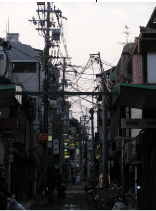
Figure 2-15: Side street, Kyoto (Kyoto Prefecture) The density of power lines on this side street is remarkable.

Karan (2005) offers two explanations about why the Japanese landscape has a dizzying array of power lines. Karan suggests that given the frugality of Japanese society, burying these lines is too costly. Japan's greater concern for inside space, compared to outside space, means that many Japanese view street space as functional and have no problem with above-ground power lines.