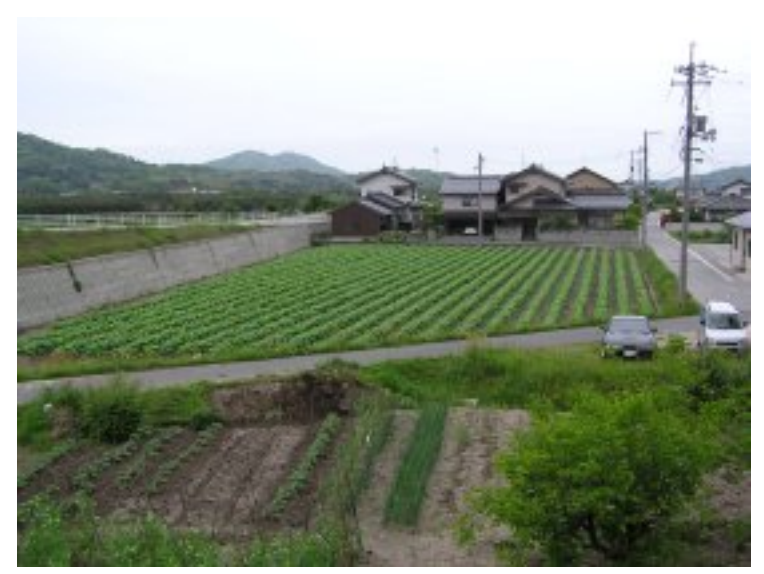
Figure 2-7: Houses, Yasugi (Shimane Prefecture)

One might expect more lawns in rural areas because of more space. However, notice here that several houses have clustered together and maximized the amount of agricultural land. So this suggests that the lack of lawns on the Japanese landscape is as much a cultural preference as a reaction to the lack of space.