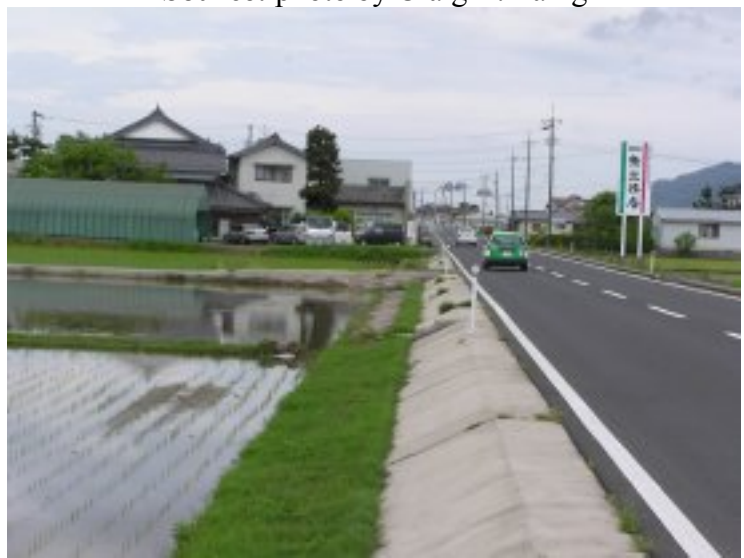
Figure 2-9: Highway near Izumo (Shimane Prefecture) Notice the quick drop off into the rice field.