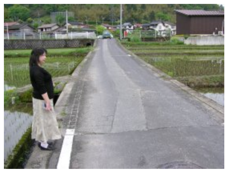
Figure 2-10: Street, Hirose (Shimane Prefecture)

Here is an extreme example of lack of roadside shoulders. Note the car in the distance and the lady to give a perspective of the width of this road. A little ice on this roadway would make for a very interesting drive.