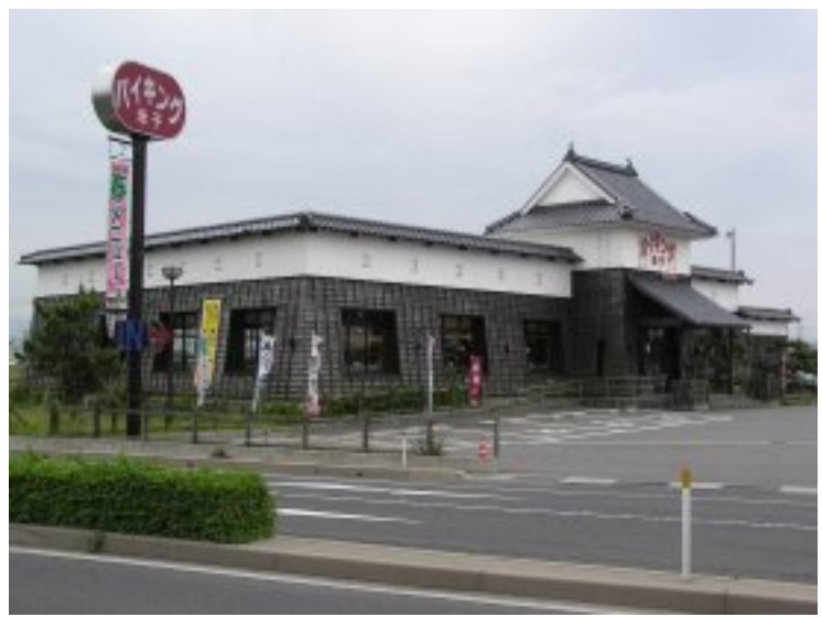
Figure 2-40: Restaurant, Yonago (Tottori Prefecture) This buffet restaurant resembles an Edo Period castle.