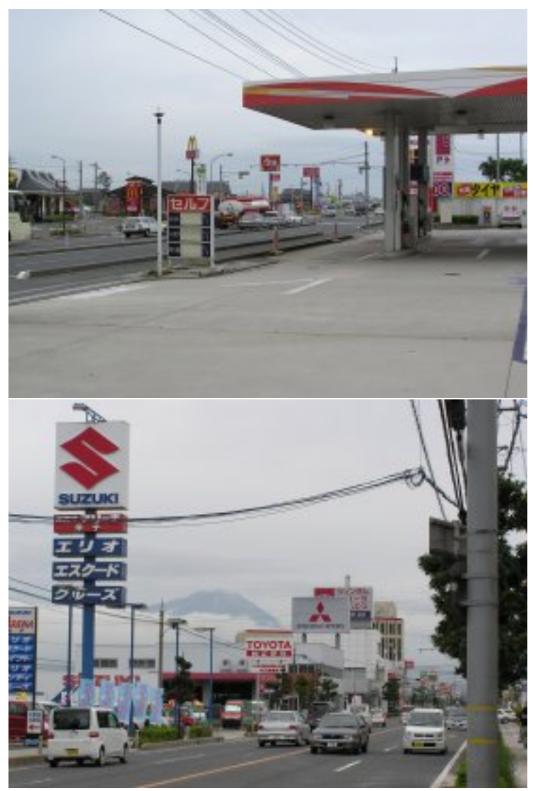
Figure 2-36 and 2-37: Suburban sprawl, Yonago (Tottori Prefecture) Change the language on the signs and this could be anywhere in the United States.