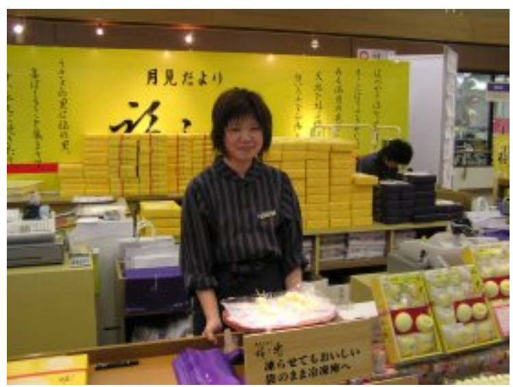
Figure 2-44: Kotobukijo Confectionery, Yonago (Tottori Prefecture) This food theme park is devoted to sweets. It consists of numerous booths devoted to different dishes with samples.