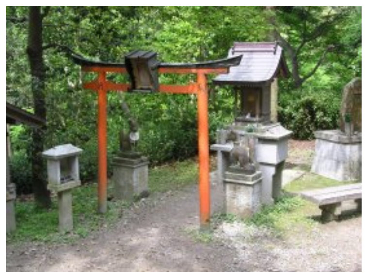
Figure 2-24: Shinto shrine and torii gate, near Kiyomizudera, Kyoto (Kyoto Prefecture) This small shrine has physical objects common to a Shinto shrine. Go to this Web site (<a href="http://www.japan-guide.com/e/e2059.html">http://www.japan-guide.com/e/e2059.html</a>) and read about the structures and objects at a Shinto shrine. How many of these structures and objects can you identify? At the Web site, read about the different groups of shrines. What kind of shrine is this, what kami (or god) is it dedicated to, and how can you tell?