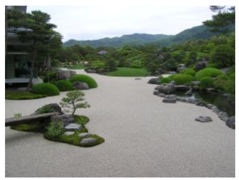
Figure 2-1: Adachi Art Museum gardens, Yasugi (Shimane Prefecture)

This garden has been rated the best garden in Japan by The Journal of Japanese Gardening for 2003, 2004, 2005, and 2006. It is a great example of how many Japanese gardens are idealized representations of nature. Note the meticulously pruned shrubs. Do you see any debris, such as leaves or twigs? Also, museum patrons view the garden from behind glass or a small outdoor viewing area on the garden's edge (notice the glass windows to the left). In your opinion, how natural does this garden look? Further information about this garden can be found