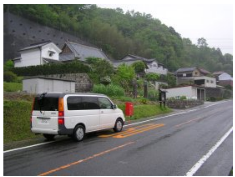
Figure 2-8: Highway near Asuke (Aichi Prefecture) This van has pulled off onto the shoulder (Japanese drive on the left side of the road) and is still partially in the road.