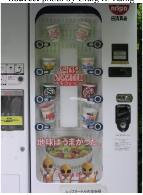
Figure 2-13: Vending machine, Kyoto (Kyoto Prefecture)

What is this vending machine selling? From the instructions on the left, it looks like the machine will add water and heat it for you. The purpose of the aliens in the bottom of the photograph is unknown.