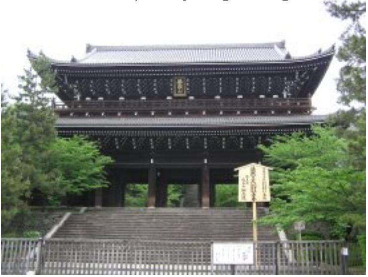
Figure 2-28: Chionin Temple, Kyoto (Kyoto Prefecture)

Go to this Web site (<a href="http://www.japan-guide.com/e/e2058.html">http://www.japan-guide.com/e/e2058.html</a>) and read about the structures at a Buddhist temple. What is the structure in the photograph? Go to this Web site to read more about this temple (<a href="http://www.japan-guide.com/e/e3928.html">http://www.japan-guide.com/e/e3928.html</a>).