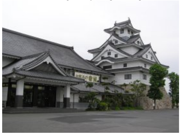
Figure 2-43: Kotobukijo Confectionery, Yonago (Tottori Prefecture) This food theme park is devoted to sweets. Notice the architectural style and the large castle keep or donjon.