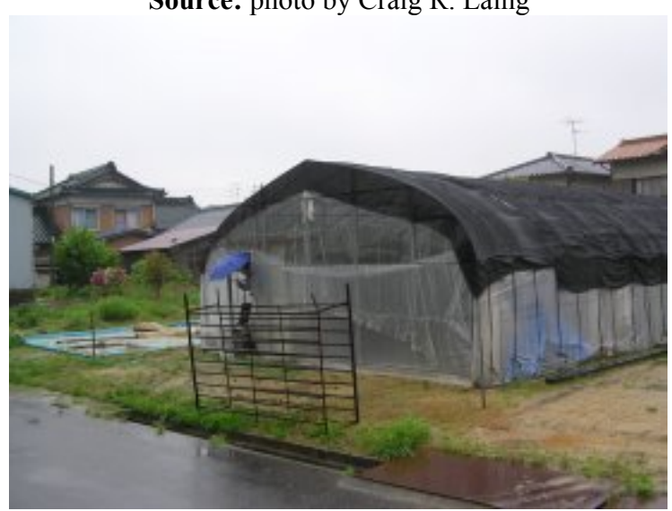
Figure 2-21: Greenhouse, Togo, suburb of Nagoya (Aichi Prefecture) This greenhouse grows rice seedlings and is completely surrounded by suburban homes.