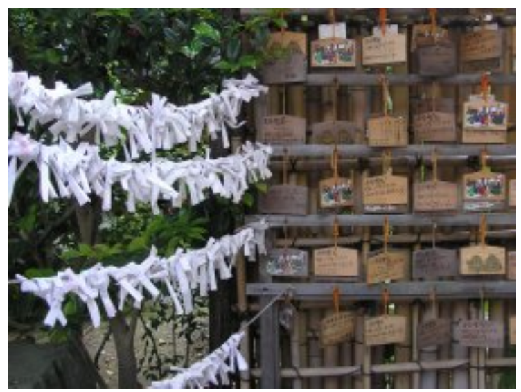
Figure 2-26: Omikuji and ema, Shinto shrine, Kyoto (Kyoto Prefecture) Omikuji and ema are commonly found at Shinto shrines. What are they? (hint: <a href="http://www.japan-guide.com/e/e2059.html">http://www.japan-guide.com/e/e2059.html</a>)