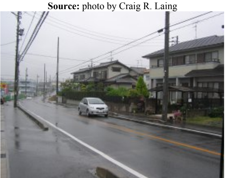
Figure 2-6: Houses and street, Togo (Aichi Prefecture) Suburban areas, like Togo (a suburb of Nagoya), also lack lawn space. Notice how these houses come right out to the street leaving no room for a lawn.

In this scene, other houses, a detached garage, a rice field, and roads have crowded out any space for a lawn. What has this homeowner done with the small space between the house and the road?