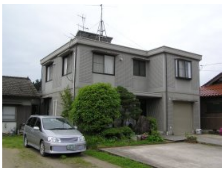
Figure 2-38: Thai-style house, Hirose (Shimane Prefecture) This house reflects a growing popularity of non-Japanese style homes. During the 1990s, Japan experienced a noticeable increase in the number of imported home styles, but they still represented a small percentage of the entire market (Karan, 2005).