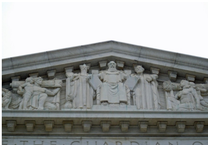
The east pediment of the Supreme Court.

See, think, wonder is a thinking routine designed to help students make careful observations and develop their own ideas and interpretations based on what they see, and help stimulate curiosity about a topic. Have students look at a projected or printed photograph of the pediment over the east entrance to the Supreme Court of the United States the center of the exterior frieze featuring from left to right, Confucius, Moses, and Solon. Students will make note of what they see, what they think about what they see, and what they now wonder after seeing this photograph. The teacher can guide them to notice small details, to address all individuals in the façade, and look for connections between the three. It is likely at this point students will have far more “sees” and “wonders” than “thinks.”