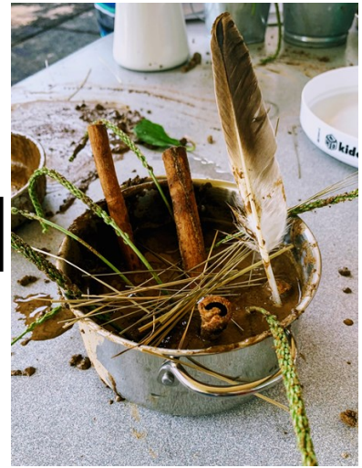
Mud Pie at Summer Kick-Off