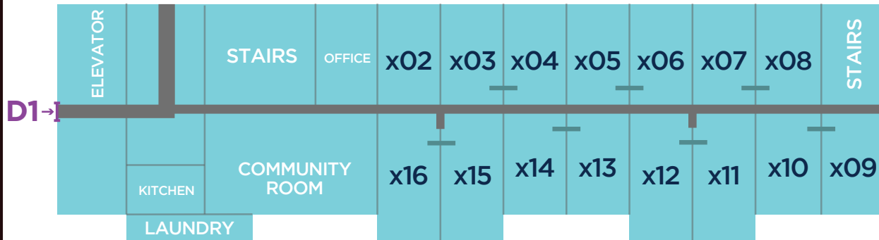
STAGMAIER GROUND FLOOR