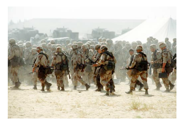
U.S. troops deployed during Operation Desert Shield.

Specific to U.S. involvement in Desert Storm, Bush had deployed over 500,000 U.S. troops to Saudi Arabia in the five months after the Iraqi invasion of Kuwait. The U.S. countermeasure, was named Operation Desert Shield. Bush announced this was a defensive measure but "made no effort to seek authority from Congress" (Fisher, 2004,169).