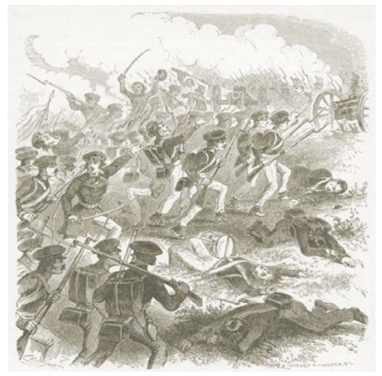
The Battle of Cerro Gordo during the Mexican War.