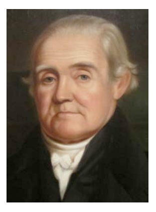
Noah Webster.