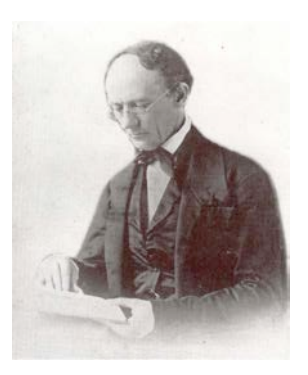
William McGuffey.