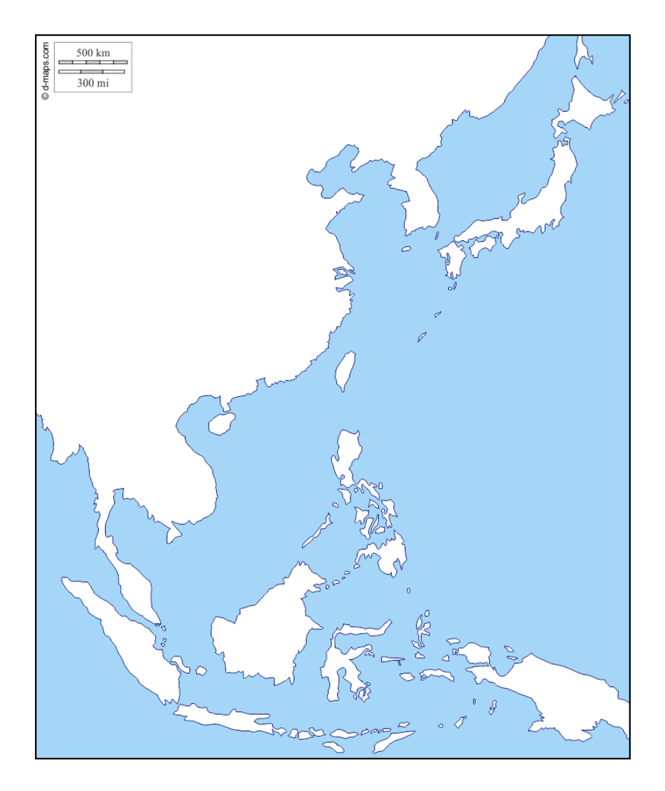
Blank map of East Asia.

China Japan North Korea South Korea Việt Nam