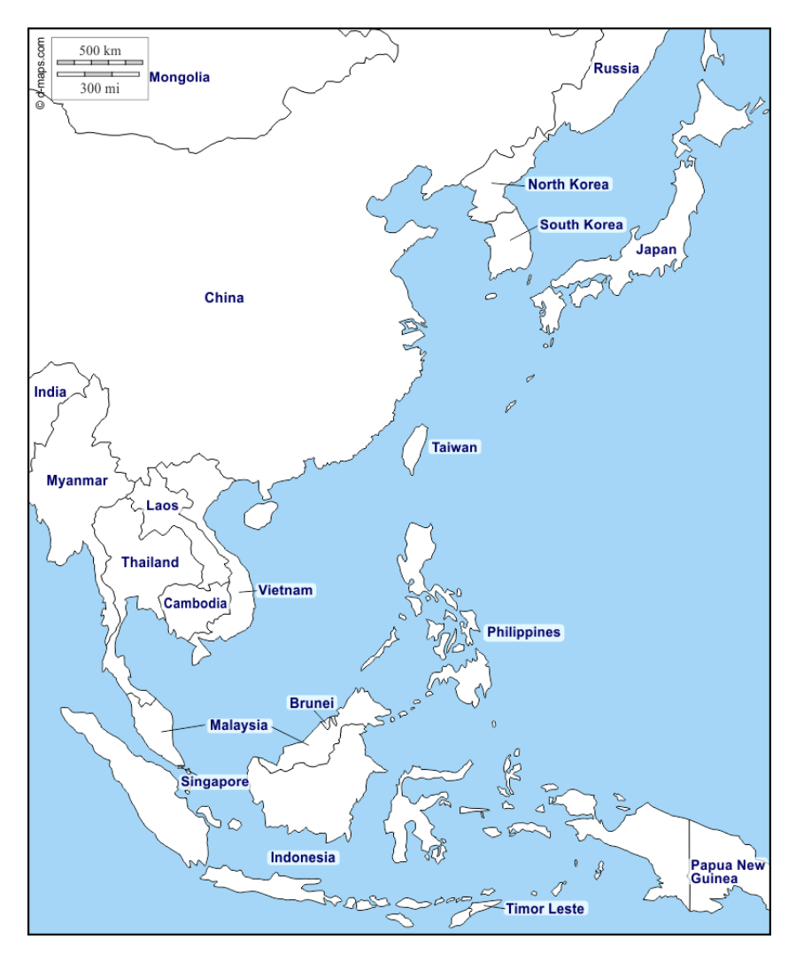
Political map key of East Asia.

Display the below <u>nighttime satellite image of the Korean peninsula</u> from National Geographic . Ask students about the contrast between North and South Korea. How does this image confirm or change the students' preconceptions about the two Koreas discussed at the beginning of the lesson?