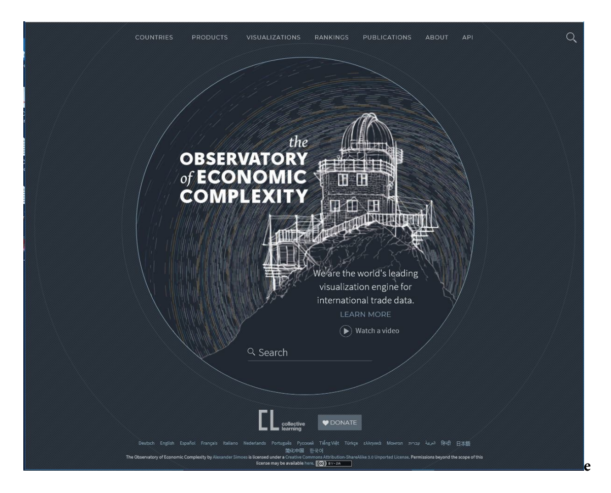
MIT: The Observatory of Economic Complexity home page.

Activity No. 1: Using the MIT Economic Complexity website