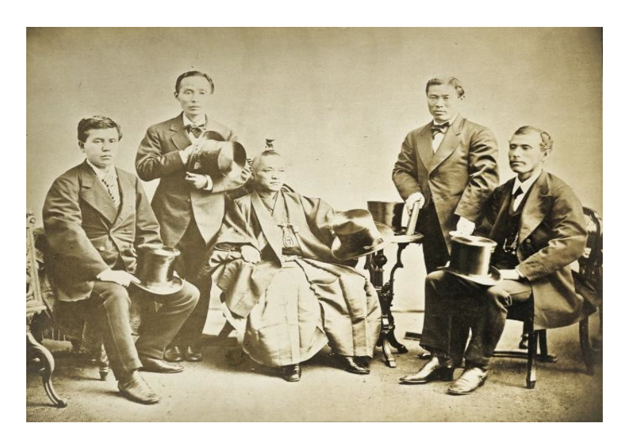
Leaders of the Iwakura Mission, photographed in London.

Students should be contextually familiar with various Western interventions in Asia during the early and mid-nineteenth century, particularly the British and Chinese relationship surrounding the Opium Wars and the "American 'opening" of Japan during the latter Tokugawa period. The events that led to the downfall of the Tokugawa, the success of the Meiji Restoration, and the moves toward Westernization presented by the Meiji reformers (eg, the Iwakura Mission) set the stage for this module. Familiarity with the process of industrialization and the urbanization and modernization that accompany it will help students understand the context of the rise of militarism in Japan. Familiarity with the features of imperialism of the Western powers and their similarity to Japanese imperialism in this period, particularly the occupation of and abuses in Korea, contextualizes the Japanese development of national character.