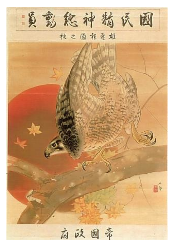
"Leaping Patriotic Autumn," a Japanese poster promoting patriotism.

Kokutai: Japanese national identity on the eve of World War II Estimated time: fifty minutes