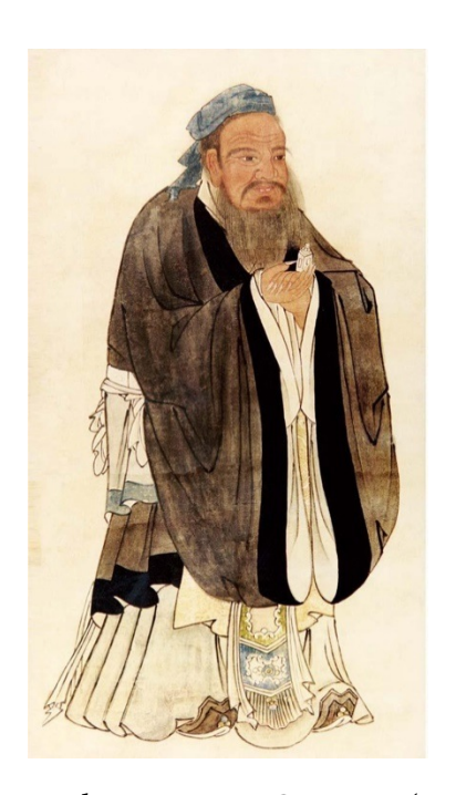
A portrait of Confucius by the Ming dynasty artist Qiu Ying (ca. 1494–1552).

Trish King Girls Preparatory School Chattanooga, Tennessee