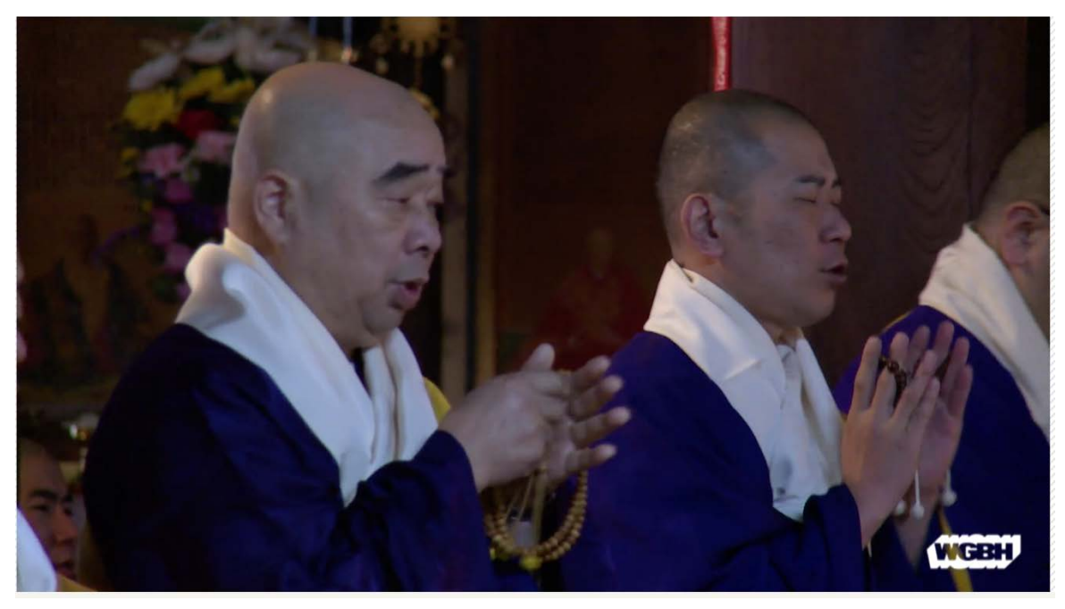
Screen capture from "The Evolution of Buddhism."

and twenty seven seconds) from NTDTV on YouTube before reviewing the key aspects of Buddhism and Confucianism listed below.