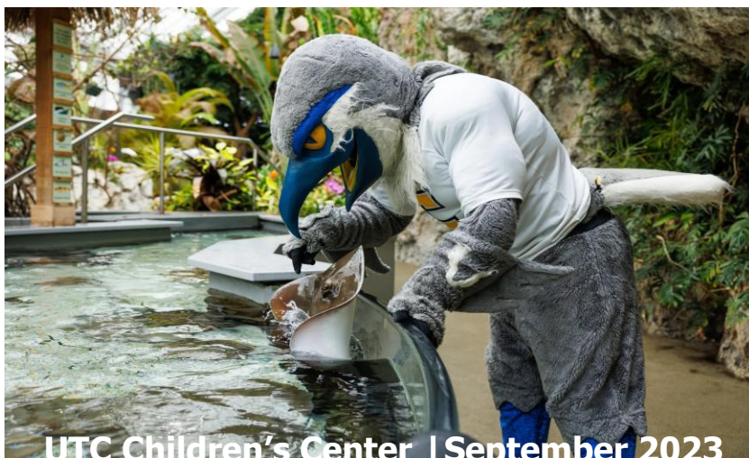
UTC Children's Center | September 2023