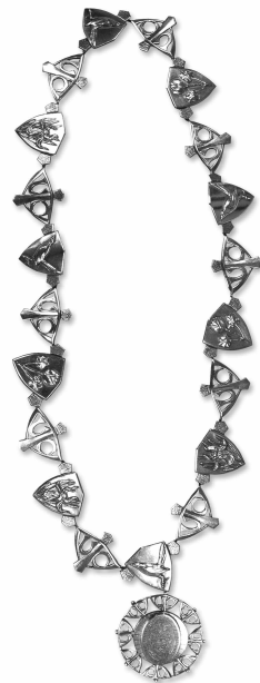
Chancellor's Chain of Office