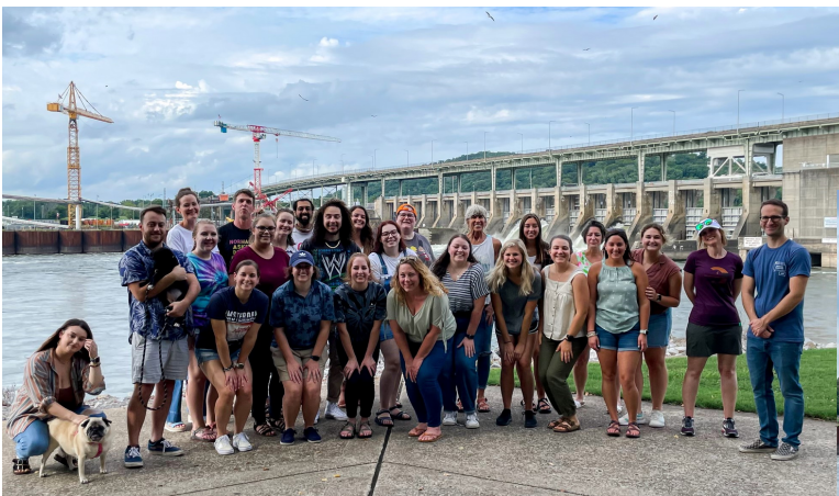
CSI Cookout at Tennessee RiverPark, August 21, 2021