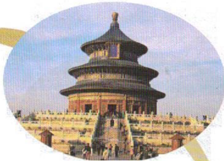
天坛(Tiāntán) The Temple of Heaven