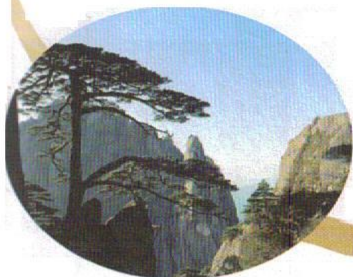
黄山(Huángshān) The Yellow Mountains