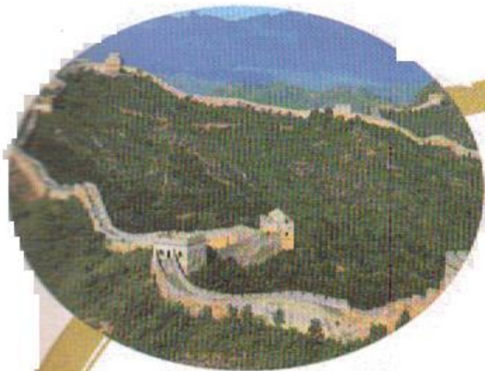
长城(Chángchéng) The Great Wall