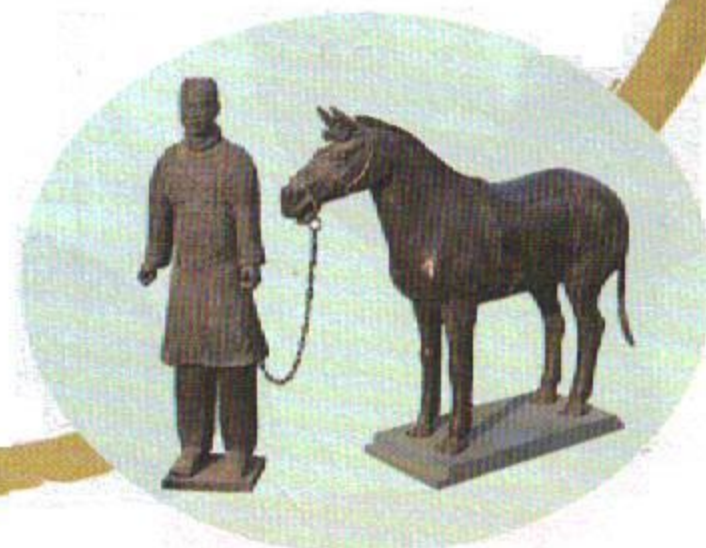
兵马俑(bīngmǎyǒng) Terracotta warriors and horses