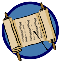
Torah – Judaism