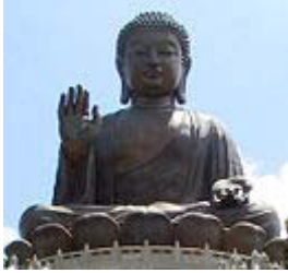
Buddha – Buddhism