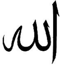
Allah – Islam