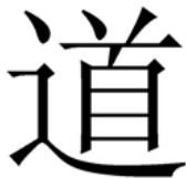
Chinese Character for Tao