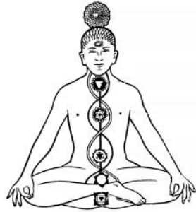
Chakras – Buddhist, Hindu, or Jainist