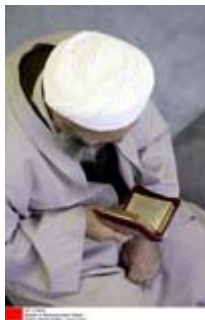
Koran Q'uran Islam