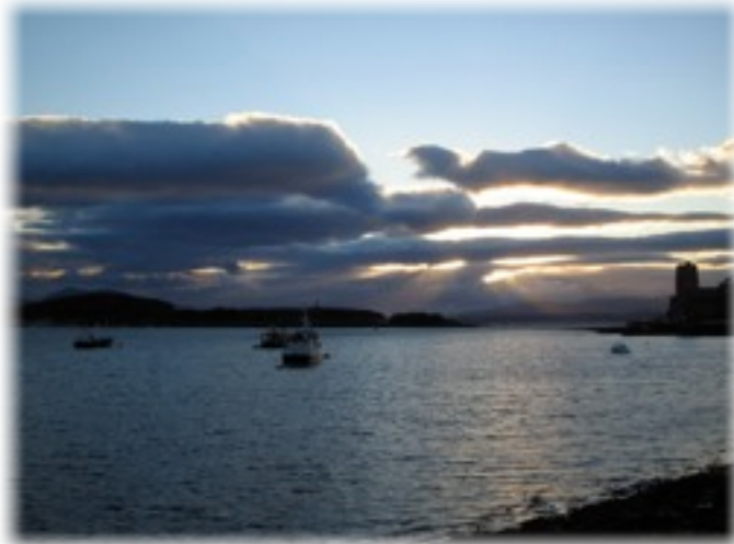
The harbour at Oban, Scotland, June 2008

The course calendar and travel itinerary are available in a supplement to this syllabus.