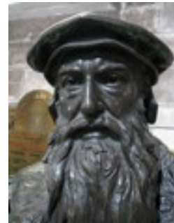
John Knox St. Giles Cathedral Edinburgh, Scotland