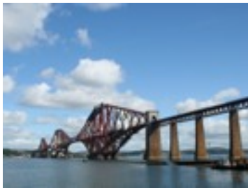
Firth of Forth Railway Bridge

Because it is the job of an educated person to be informed. History students should keep informed of current events. You are encouraged to visit on a regular basis either a Scots newspaper or a UK news service. For example,