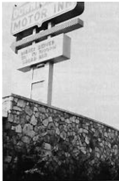
17. Downtowner Motor Inn.