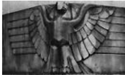
Granite eagle guards the entrance to the Federal Building.