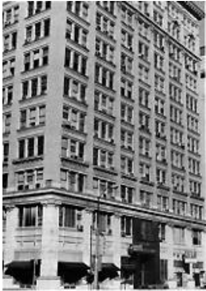
23. James Building.