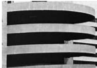
City Park Garage.