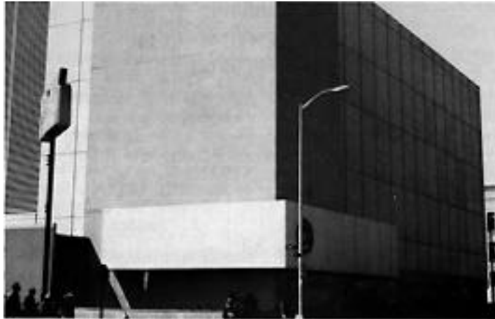
38. South Central Bell.