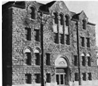
37. Department of Education.