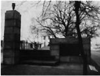
10. War Memorial.