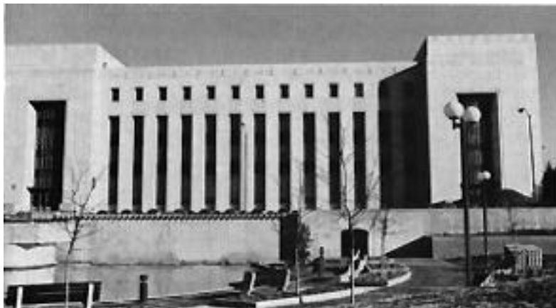
12. Federal Building.