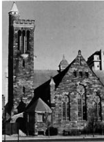
18. Second Presbyterian.