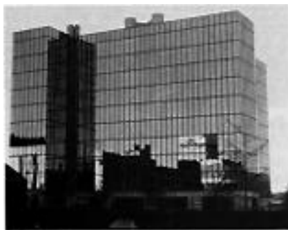
All glass Blue Cross Building.