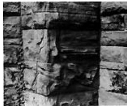
Cross-bedded sandstone shows weathered out effect at Second Presbyterian.