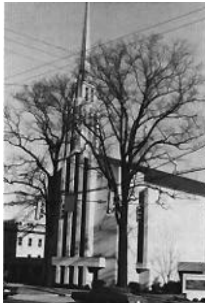
3. First Centenary United Methodist.