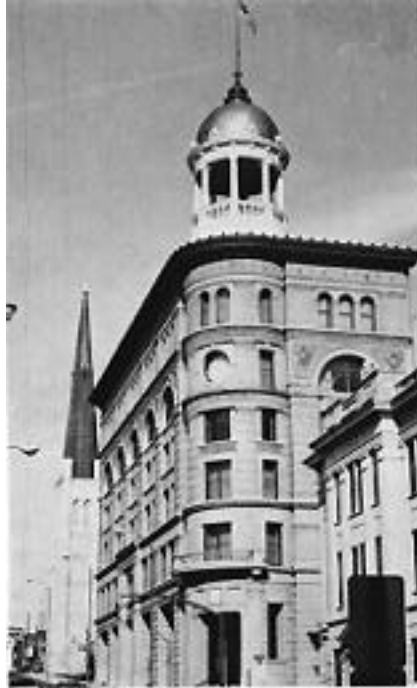
5. Dome Building.