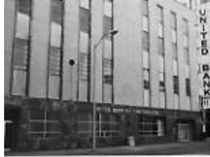
20. United Bank.