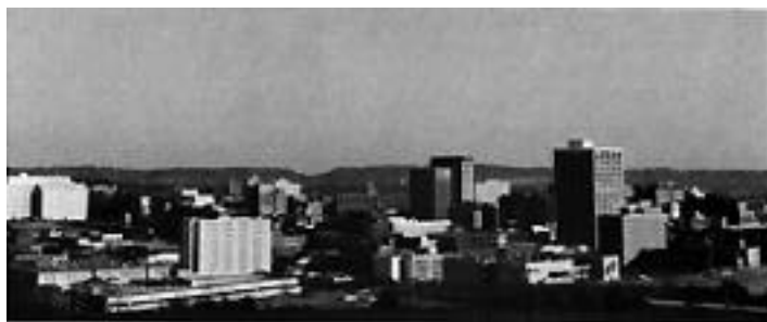
View of Downtown Chattanooga from Cameron Hill.