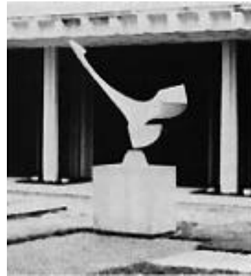
Modern sculpture in the courtyard of the Gateway Professional Building.