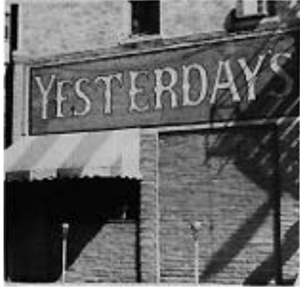
9. Ross Hotel.