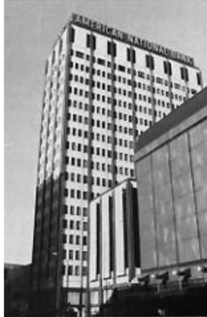
28. American National Bank.