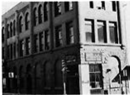
25. Melton Building.