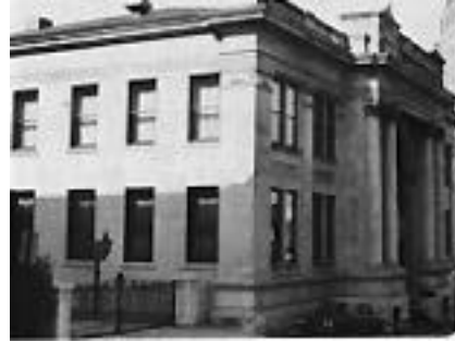
6. North American Royalties Inc.