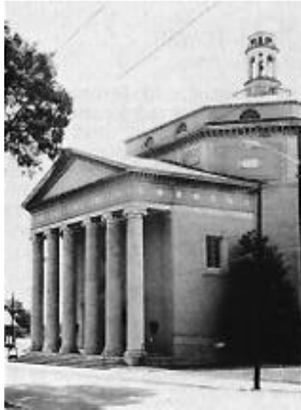
1. First Presbyterian Church.