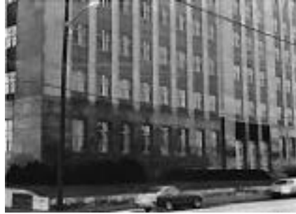
2. Interstate Life and Accident.