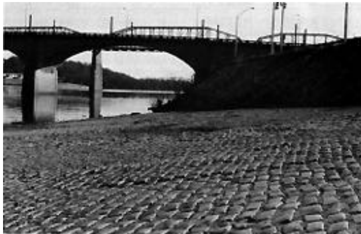
39. Ross Landing.