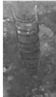
Fossil cephalopod on the 3rd floor of the Federal Building.