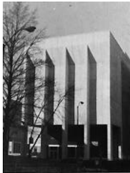
34. Criminal Justice.