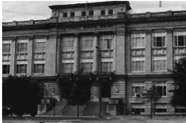
14. City Hall.