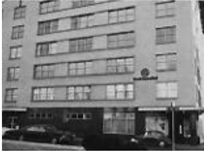
13. Emerson Building.