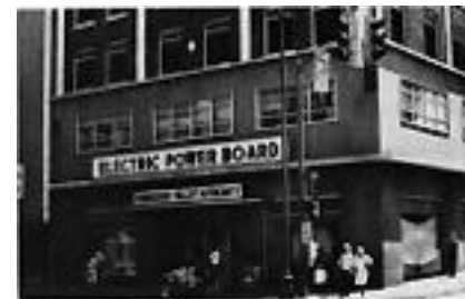
33. Electric Power Board.