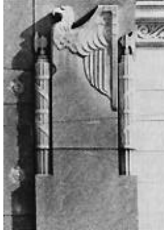
Granite Roman fasces flank the entrance to the Chattanooga Bank building.