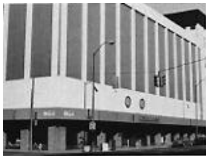
31. Miller Building.