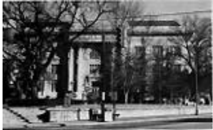
35. Hamilton County Courthouse.