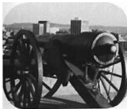
Civil War cannon overlooks Downtown Chattanooga from Cameron Hill.