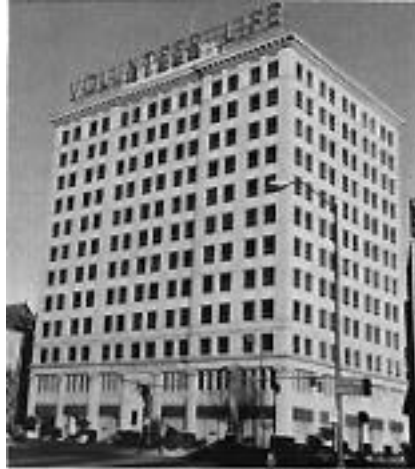
11. Volunteer State Life