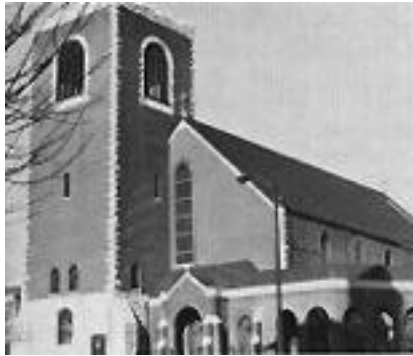
19. St. Pauls Episcopal.