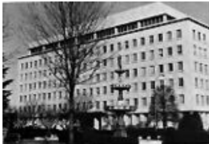
36. Provident Life and Accident.