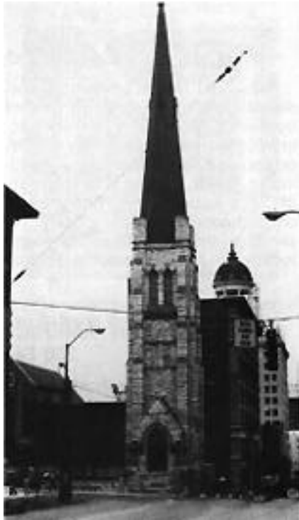
4. Old Stone Church Tower.