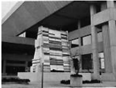
16. Bicentennial Library