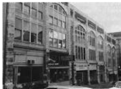
8. Adams Block.