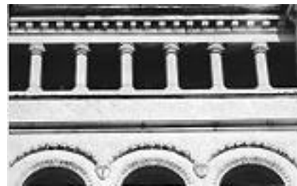
Old Post Office.