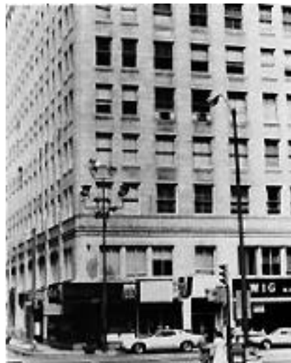
26. Chattanooga Bank Building.