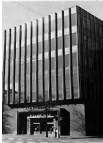
24. Pioneer Bank.