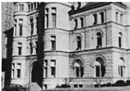
15. Old Post Office.