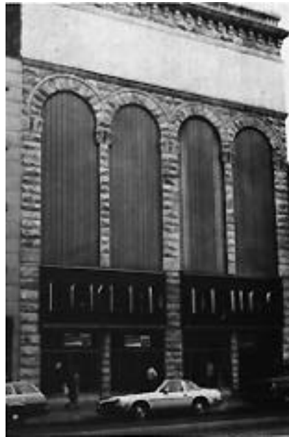
29. Eckerd Drugs.