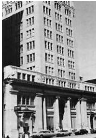
22. Maclellan Building.