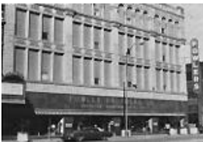
21. Fowler Brothers.