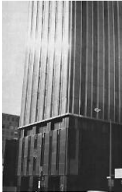
30. First Tennessee Bank.