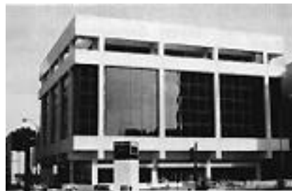
32. First Federal.