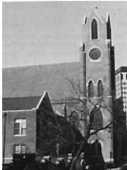
7. Sts. Peter and Paul's