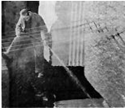
Granite block being cut by a wire band saw.