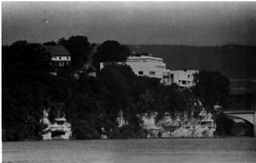
Figure 3. The Hunter Museum of Arts sits above bluffs of Copper Ridge Dolomite (Knox Group) as exposed along the Tennessee River.