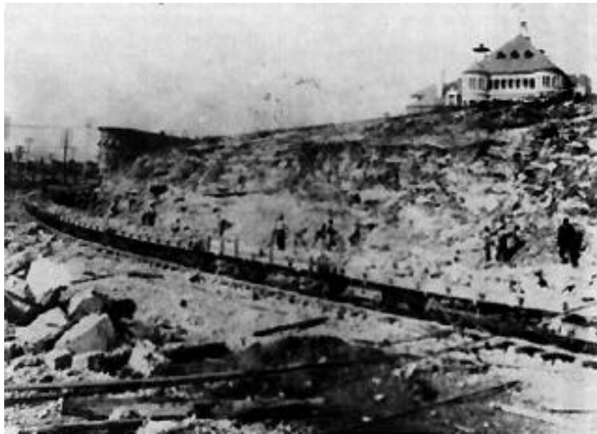
Figure 6. Stone Fort Quarry in downtown Chattanooga.

— Chattanooga Yesterday and Today Volume I Heiner Printing Company 1951