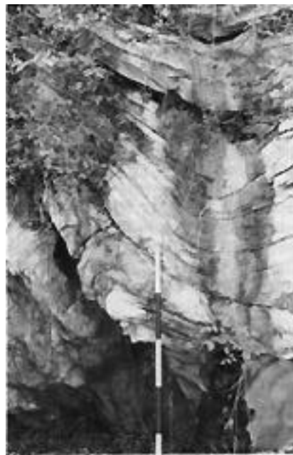
Figure 5. Deformed Ordovician limestones at Gold Point near Chickamauga Lake.