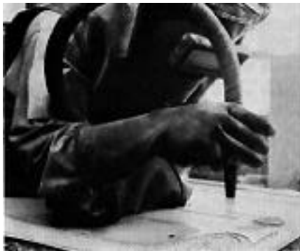
Carving of the polished stone using abrasive and high pressure nozzle.