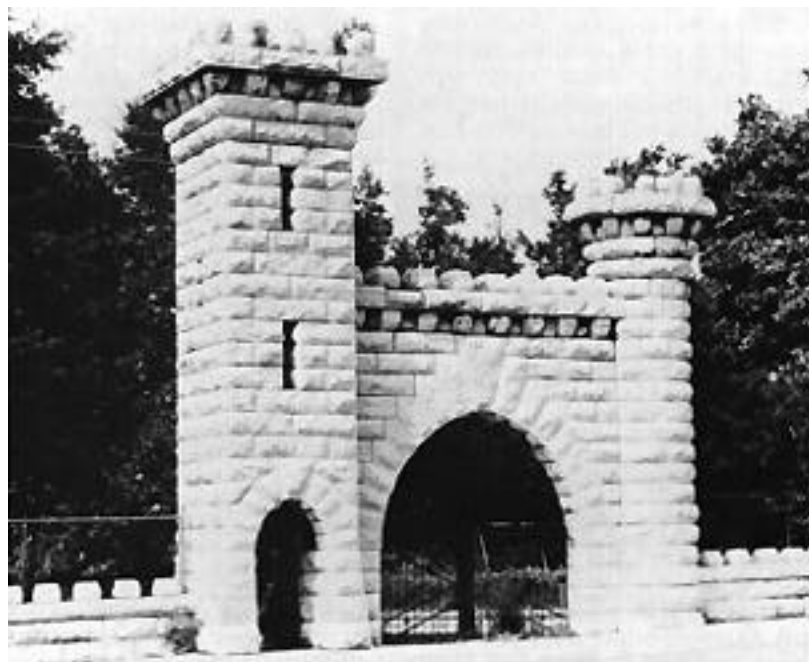
Figure 8. Entrance to Confederate Cemetery, East 5th Street.