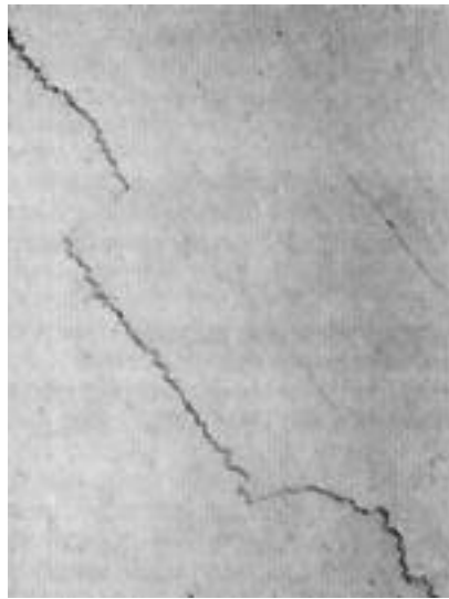
Stylolitic seam in Tennessee "Marble"