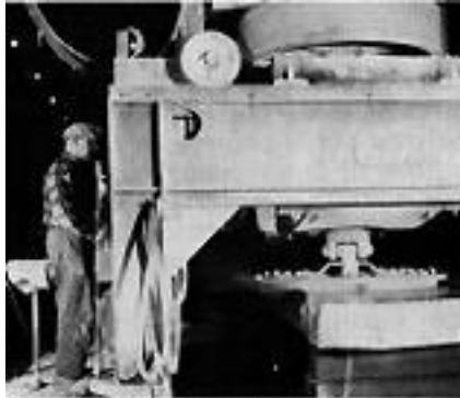
Large metal disc used to provide a finely polished surface.