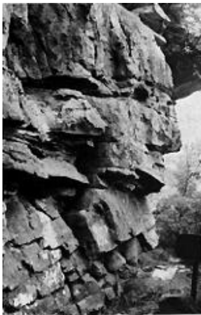
Figure 4. Massive Pennsylvanian aged sandstones on top of Lookout Mountain.