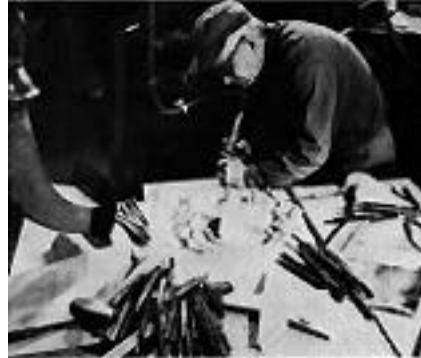
Hand carving of stone.