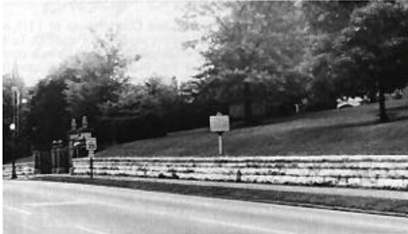
Figure 7. McCallie Avenue Entrance to UTC