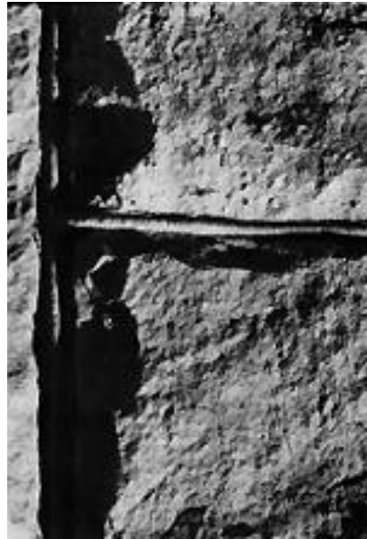
Conglomeratic sandstone (Sedimentary)