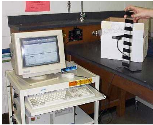
The experimental set-up