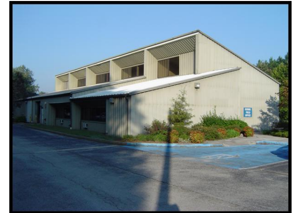
UTC's Advanced Vehicle Test Facility

The University of Tennessee at Chattanooga Center for Energy Transportation and the Environment in cooperation with the Division of Continuing Education