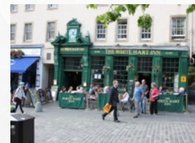
Public Houses in the Grass Market have served the public for hundreds of years