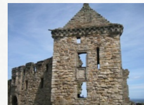
Ruins remain in St. Andrews from the upheaval that signaled the Protestant Reformation.