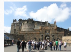
Ancient Edinburgh Castle, the traditional seat of Scottish Royalty, houses the Crown Jewels of Scotland