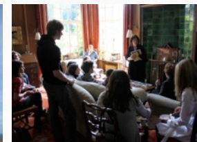
Discussion in the St. Andrews home of noted author Jane Yolen.