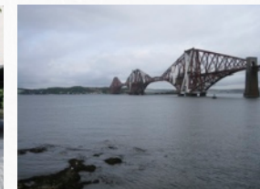
The Firth of Forth railway bridge, an engineering marvel since the late 19th Century